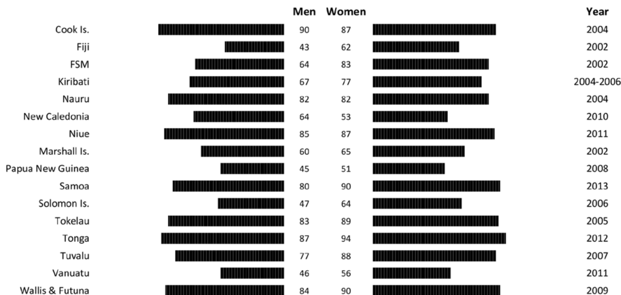
Figure 2: Percentage of overweight and obese men and women Source: Most recent WHO STEP surveys or national health agency survey data

National reports for Beijing +25 include a number of policy and program initiatives to combat NCDs: