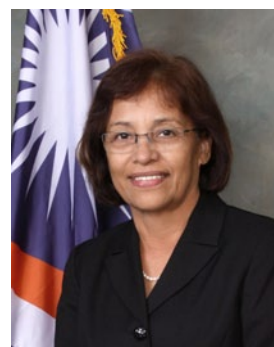
Dr Hilda C. Heine President, Republic of the Marshall Islands (2016-2020)

It is an honor for me to introduce the regional overview of progress in 25 years of implementing the Beijing Platform for Action (BPfA) in the Pacific region. In celebration of the 25th anniversary of the Beijing Declaration and Platform for Action, it is time to take stock of implementation in the Pacific region. This is in terms of what more must be done to achieve the full and equal participation of women in our societies in all areas, taking into account their diverse circumstances – where they live, how old they are, etc. – to ensure their inclusivity at all levels. Much has been achieved but more needs to be done in order to realize the world envisaged in 1995, one in which each woman and girl can exercise her freedoms and choices, realize her rights, live free from violence, go to school, participate in decisions and earn equal pay for equal work. The BPfA endures as one of the most influential international policy frameworks for women’s human rights.